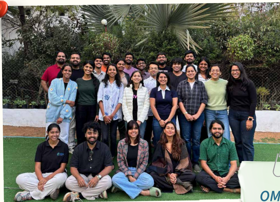
OM & MEL Teams, 2025